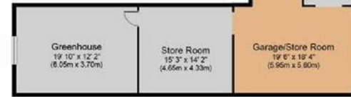
Ground Floor Approximate Floor Area 908 sq. ft. (84.3 sq. m.)

Whilst every attempt has been made to ensure the accuracy of the floor plan contained here, measurements of doors, windows, rooms and any other items are approximate and no responsibility is taken for any error, omission, or mis-statement. The measurements should not be relied upon for valuation, transaction and/or funding purposes. This plan is for illustrative purposes only and should be used as such by any prospective purchaser or tenant.