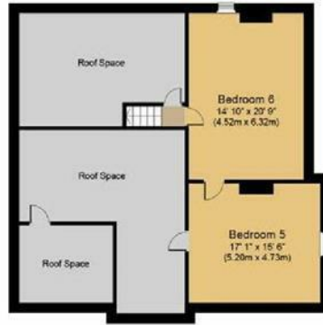
Second Floor Approximate Floor Area 1,437 sq. ft. (133.5 sq. m.)