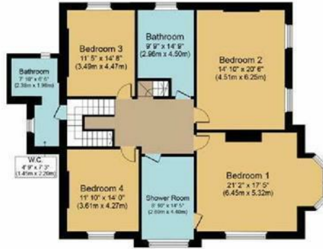
First Floor Approximate Floor Area 1,580 sq. ft. (146.8 sq. m.)