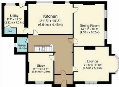
Ground Floor Approximate Floor Area 1,681 sq. ft. (156.2 sq. m.)