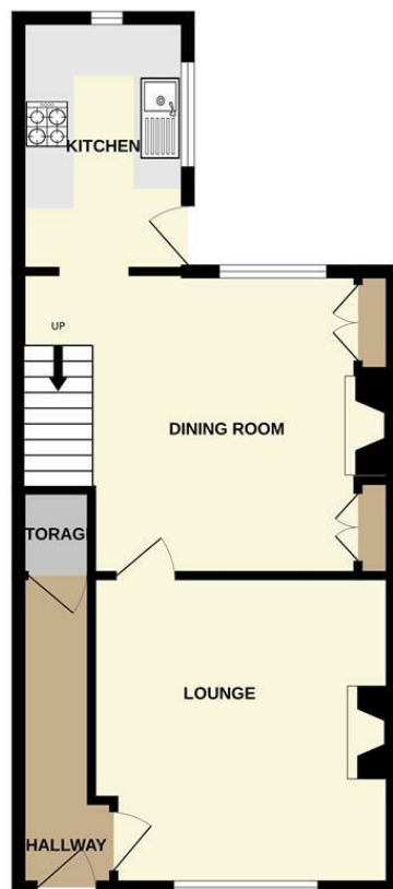
1ST FLOOR 418 sq.ft. (38.8 sq.m.) approx.