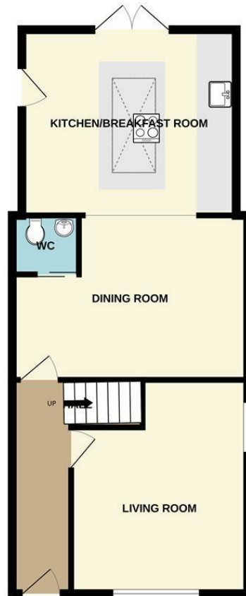
GROUND FLOOR 580 sq.ft. (53.9 sq.m.) approx.