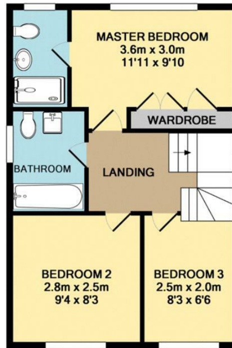
1ST FLOOR APPROX. FLOOR AREA 38.1 SQ.M. (410 SQ.FT.)

TOTAL APPROX. FLOOR AREA 80.2 SQ.M. (863 SQ.FT.)