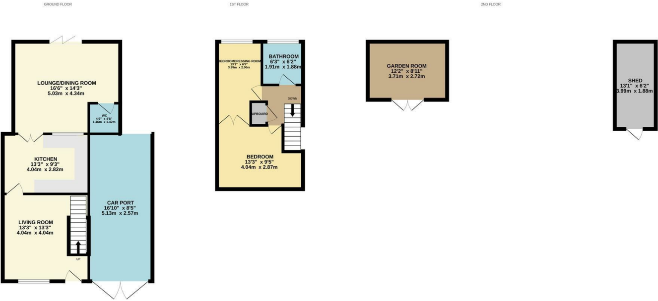
Measurements are approximate. Not to scale. Illustrative purposes only. Made with Metropix ©2025