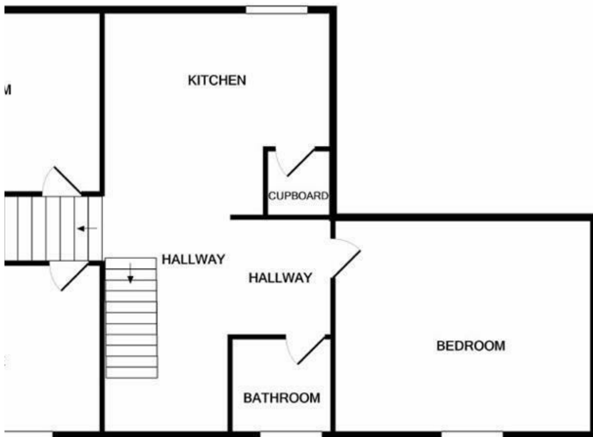
1ST FLOOR APPROX. FLOOR AREA 1079 SQ.FT. (100.3 SQ.M.)