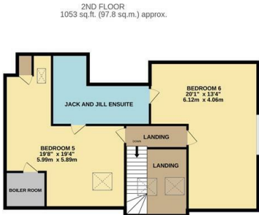
TOTAL FLOOR AREA : 3757 sq.ft. (349.0 sq.m.) approx. Measurements are approximate. Not to scale. Illustrative purposes only Made with Metropix ©2024