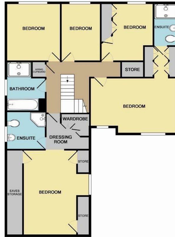
1ST FLOOR APPROX. FLOOR AREA 1212 SQ.FT. (112.6 SQ.M.)

TOTAL APPROX. FLOOR AREA 2555 SQ.FT. (237.3 SQ.M.) Whilst every attempt has been made to ensure the accuracy of the floor plan contained here, measurements of doors, windows, rooms and any other items are approximate and no responsibility is taken for any error, omission, or mis-statement. This plan is for illustrative purposes only and should be used as such by any prospective purchaser. The services, systems and appliances shown have not been tested and no guarantee as to their operability or efficiency can be given Made with Metropix ©2015