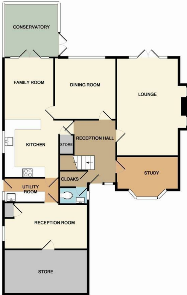
GROUND FLOOR APPROX. FLOOR AREA 1343 SQ.FT. (124.7 SQ.M.)