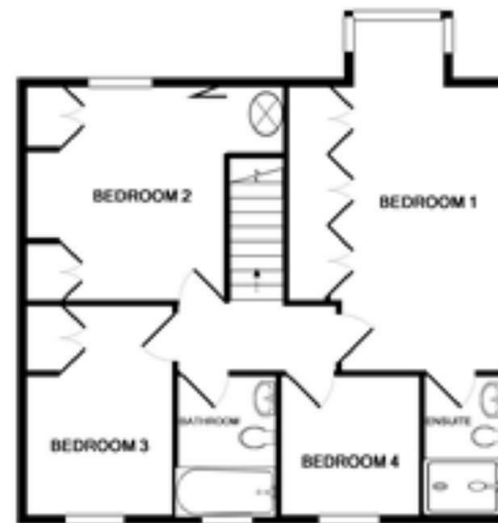
1ST FLOOR APPROX. FLOOR AREA 595 SQ.FT. (55.3 SQ.M.)

TOTAL APPROX. FLOOR AREA 1627 SQ.FT. (151.2 SQ.M.)