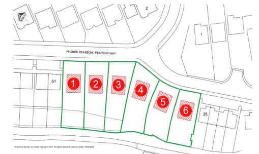
BUILDING PLOTS APPROX. 12.5 M WIDE, DEPTH RANGING FROM 28 TO 34 M PEARSON WAY, GARTHOR, NEATH Scale 1:500