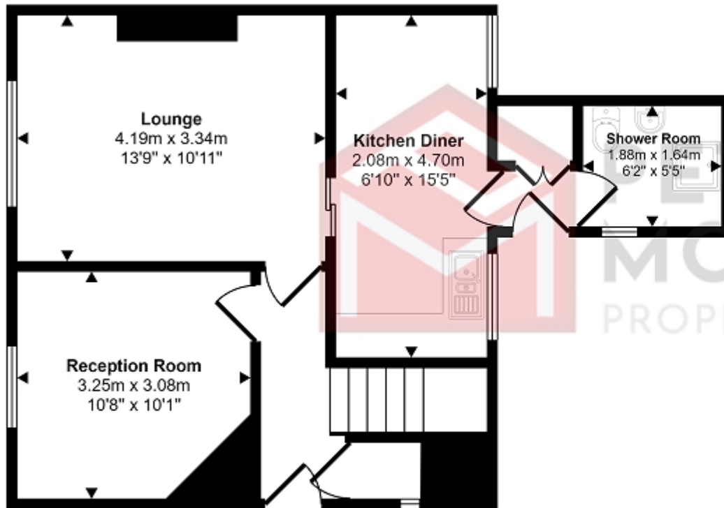
Ground Floor Approx 48 sq m / 518 sq ft

Approx Gross Internal Area 92 sq m / 988 sq ft