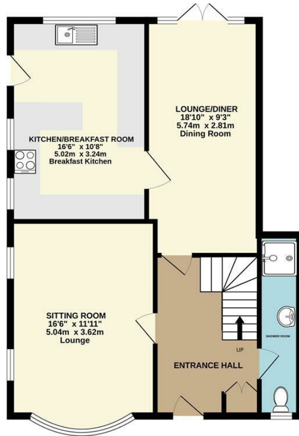
GROUND FLOOR 686 sq.ft. (63.7 sq.m.) approx.