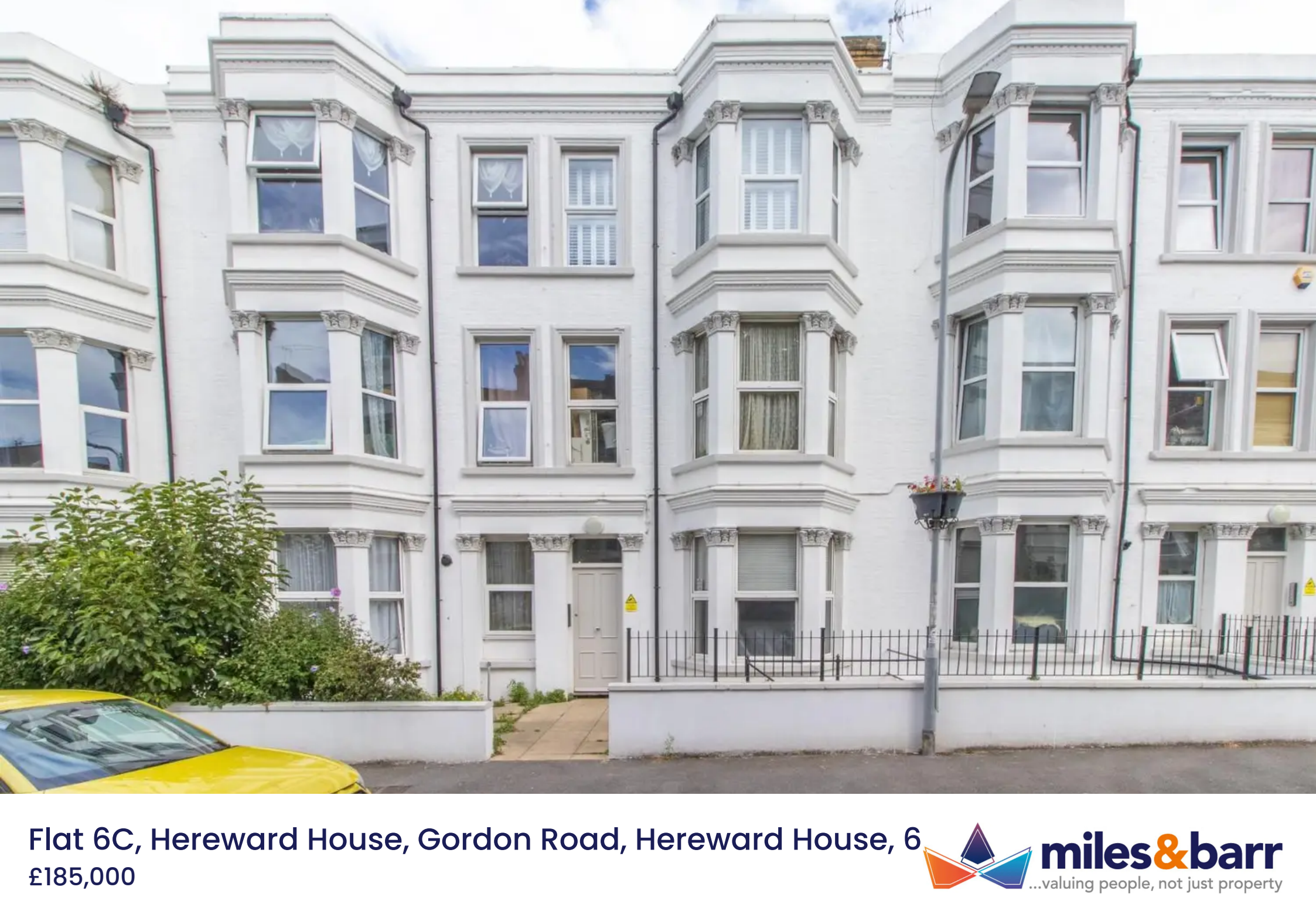
Flat 6C, Hereward House, Gordon Road, Hereward House, 6 £185,000