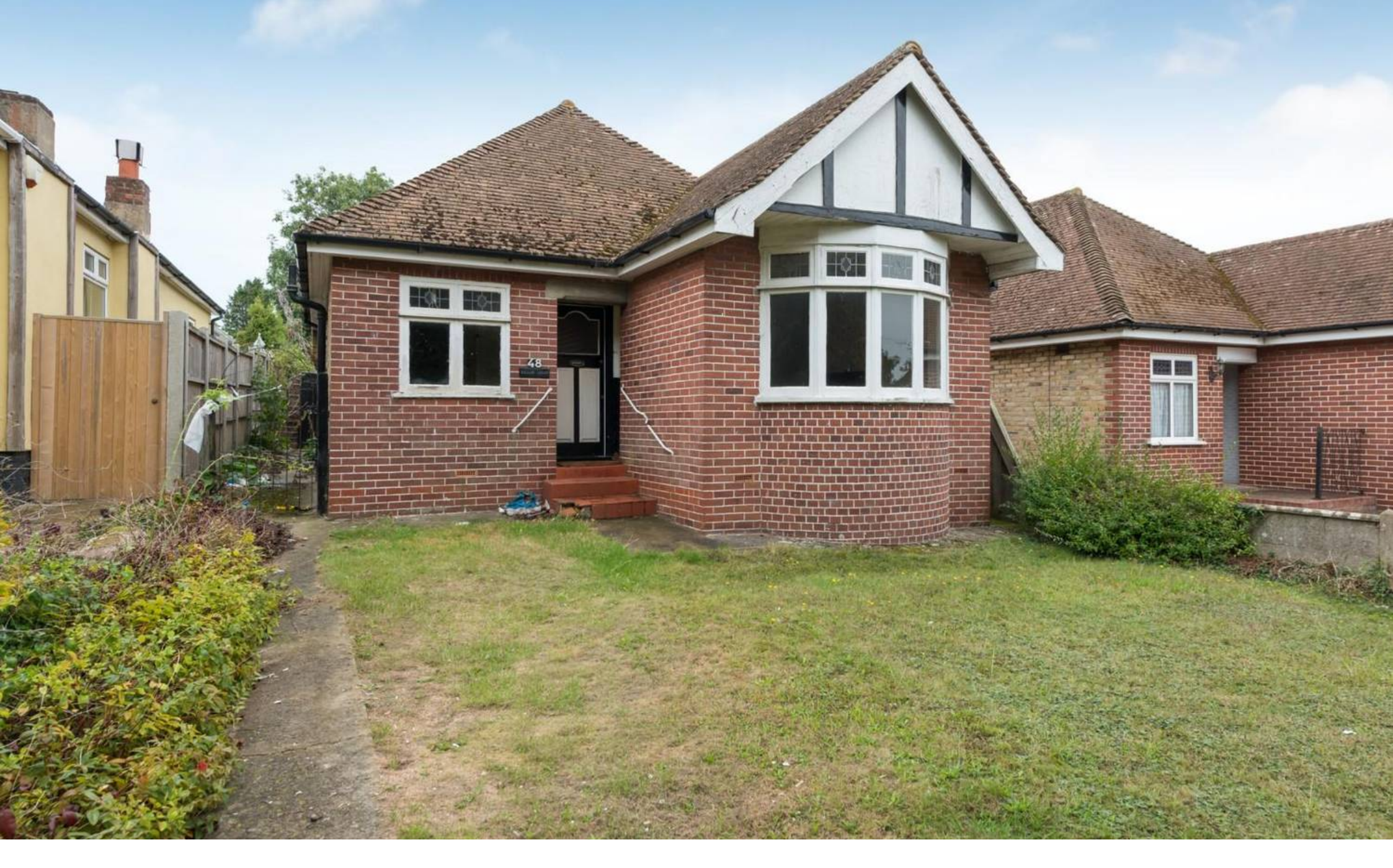
48 Nethercourt Hill, Ramsgate £295,000