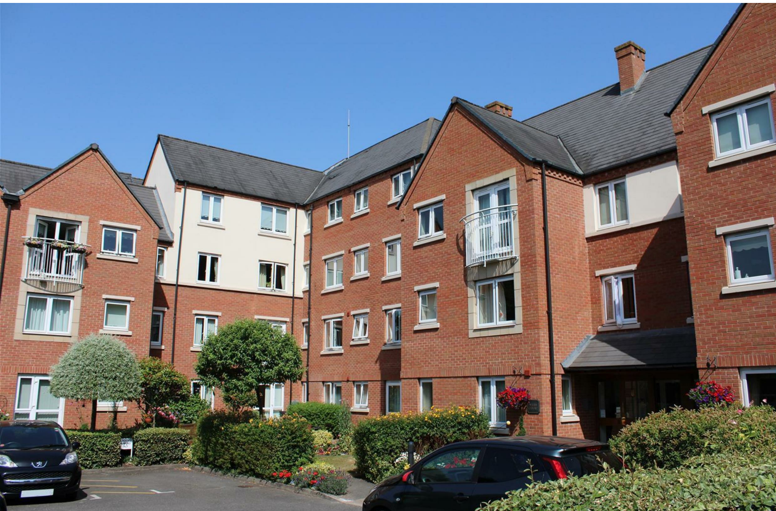
39 Webb Court Drury Lane, Stourbridge DY8 1BN