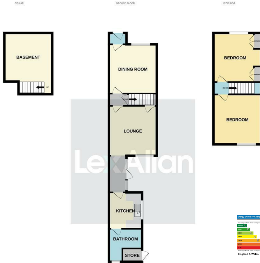
29 MOSS GROVE, DY6 8HS

Whilst every attempt has been made to ensure the accuracy of the floorplan contained here, measurements of doors, windows, rooms and any other items are approximate and no responsibility is taken for any error, omission or mis-statement. This plan is for illustrative purposes only and should be used as such by any prospective purchaser. The services, systems and appliances shown have not been tested and no guarantee as to their operability or efficiency can be given. Made with Metropix C2024.