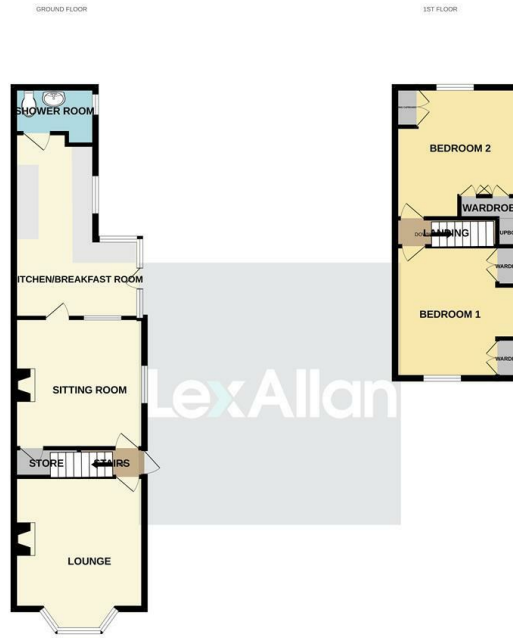
9 BLACKBERRY LANE, HALESOWEN, B63 4HX