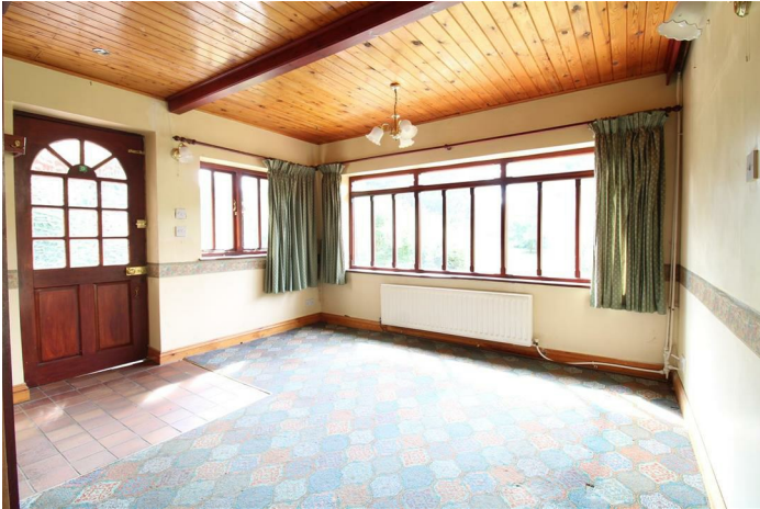
Dining Area 12'0" x 10'2"

Door to the sun room and sitting room, single glazed window to side and another over looking the generous lawn and radiator.