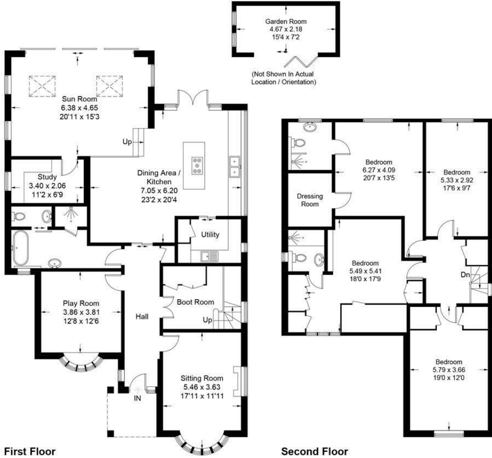
Illustration for identification purposes only, measurements are approximate, not to scale. floorplansUsketch.com © (ID1092067)

Approximate Gross Internal Area = 260.2 sq m / 2801 sq ft Garden Room = 10.2 sq m / 110 sq ft Total = 270.4 sq m / 2911 sq ft