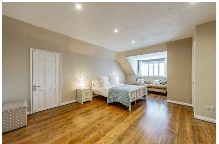
To The Front

Double glazed window to front aspect. Wood effect flooring. Inset spot lights to the ceiling. Hatch to roof void. Eaves storage. Skylight window.