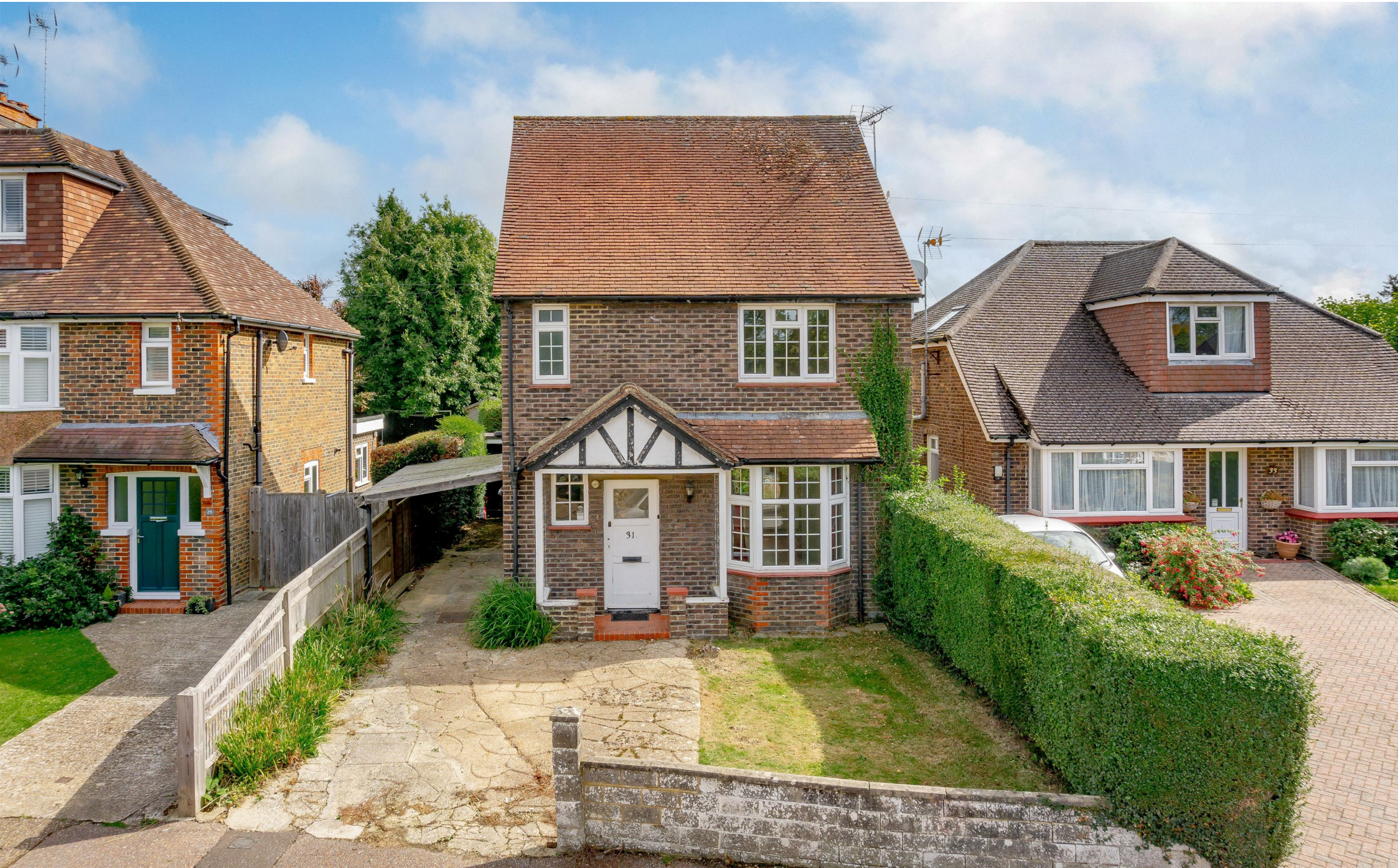
31 Hillside, Horsham, West Sussex, RH12 1NE