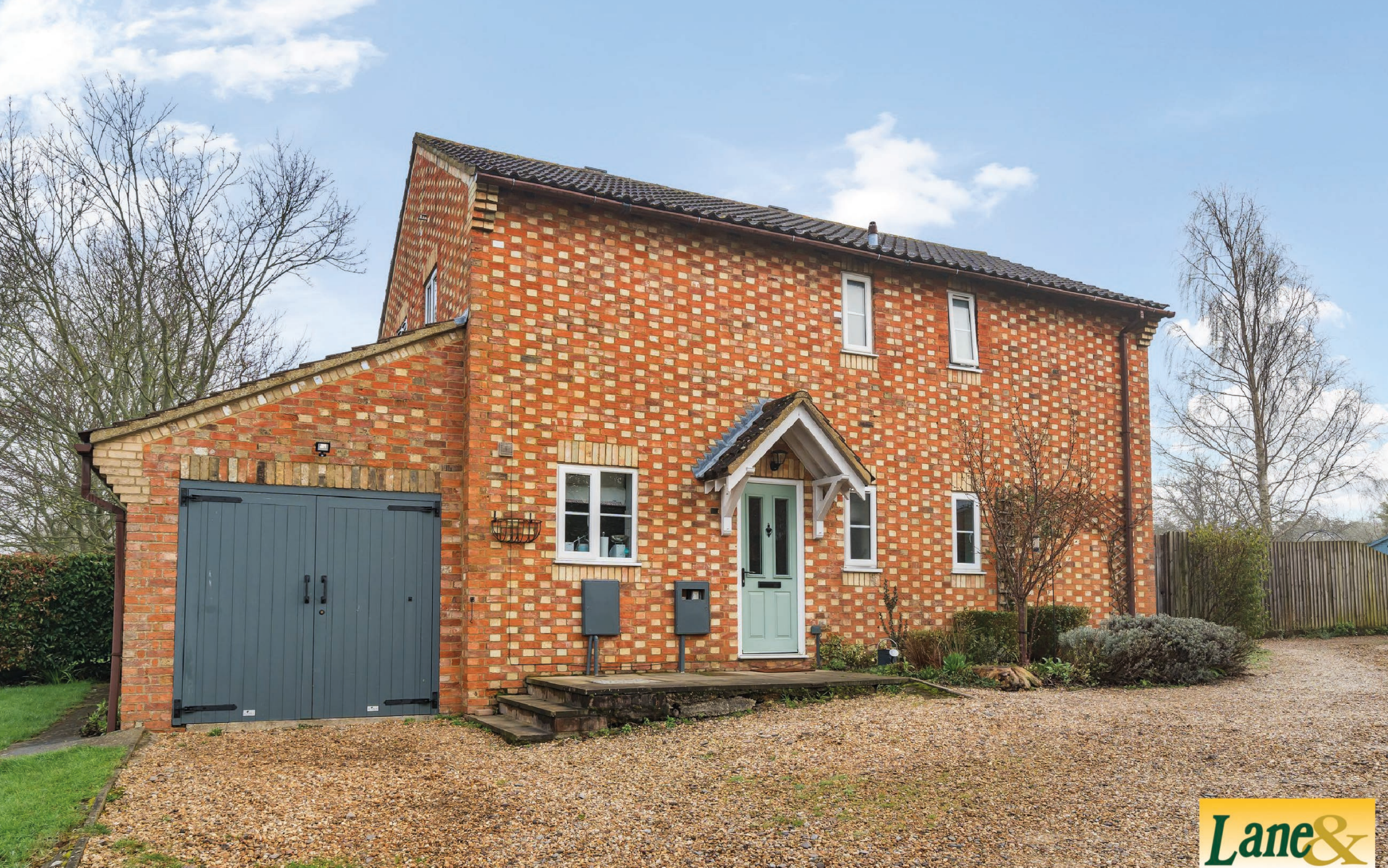
April Cottage, 5 Waldocks Close, Riseley, Bedford MK44 1DS