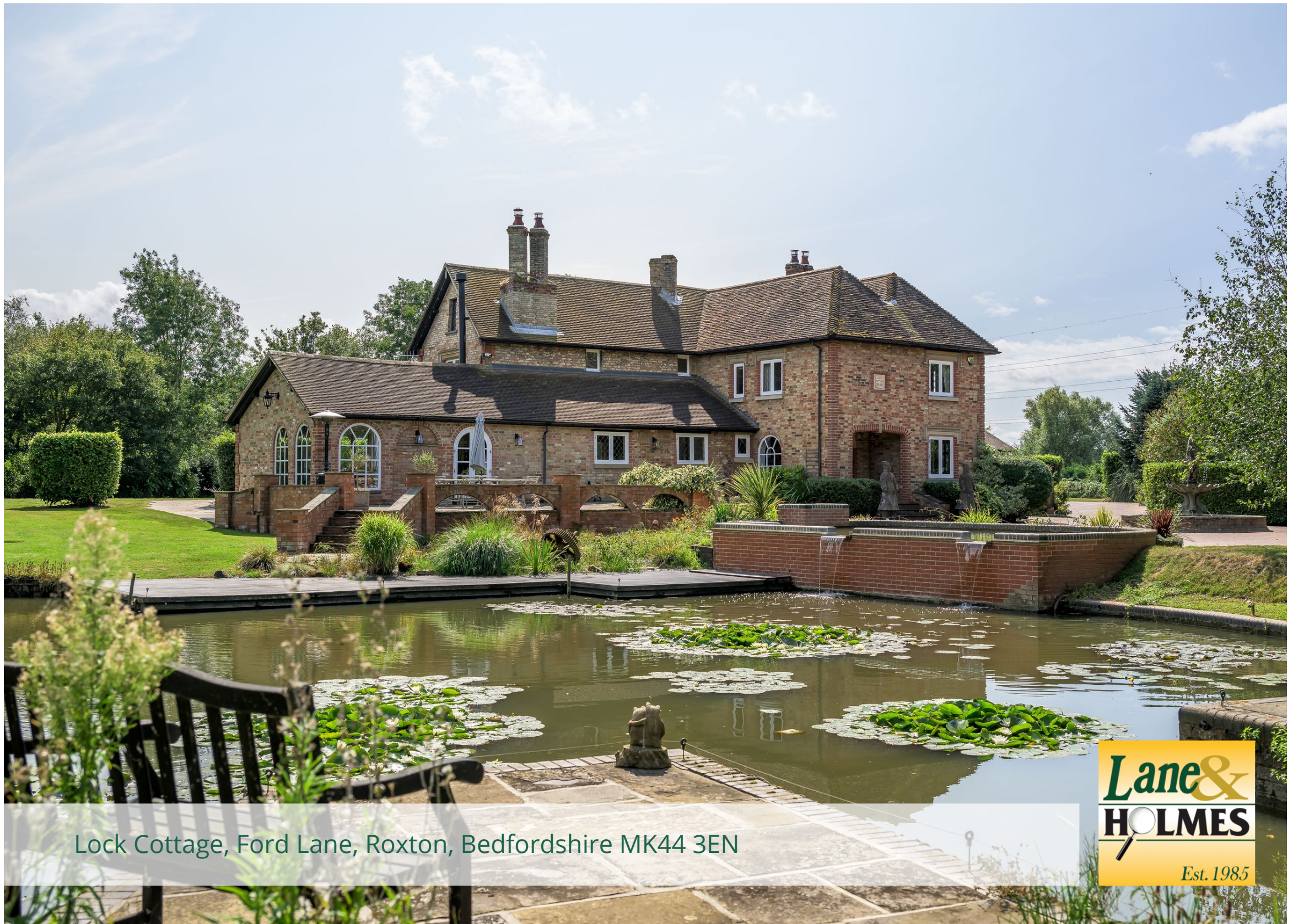
Lock Cottage, Ford Lane, Roxton, Bedfordshire MK44 3EN