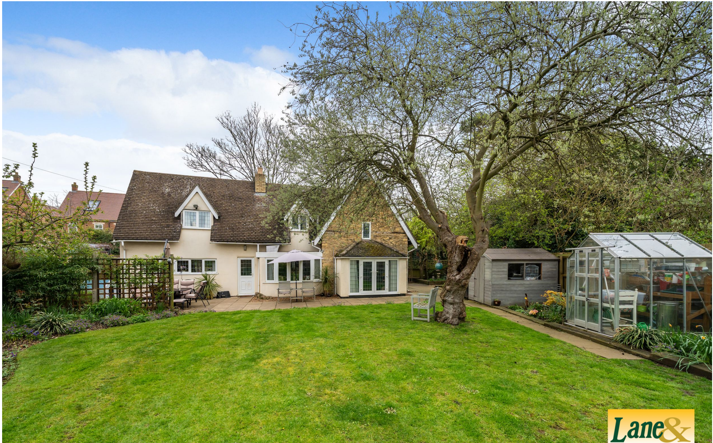
Spinney Lodge, Ridge Road, Kempston, Bedford MK42 7DA