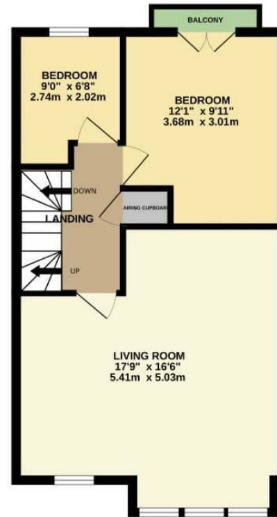
1ST FLOOR 477 sq.ft. (44.3 sq.m.) approx.