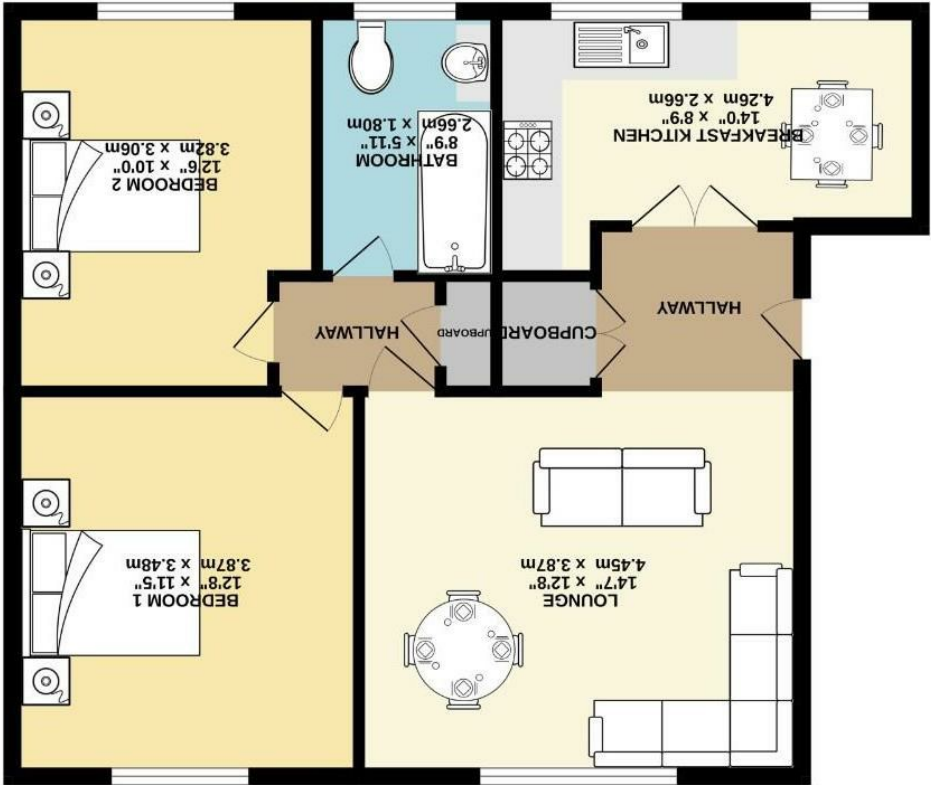
FIRST FLOOR 684 sq.ft. (63.6 sq.m.) approx.

These particulars are believed to be accurate but they are not guaranteed and do not form a contract. Neither Jordan Fishwick nor the vendor or lessor accept any responsibility in respect of these particulars, which are not intended to be statements or representations of fact and any intending purchaser or lessee must satisfy himself by inspection or otherwise as to the correctness of each of the statements contained in these particulars. Any floorplans on this brochure are for illustrative purposes only and are not necessarily to scale.