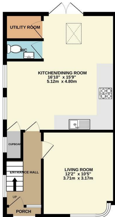
GROUND FLOOR 454 sq.ft. (42.2 sq.m.) approx.