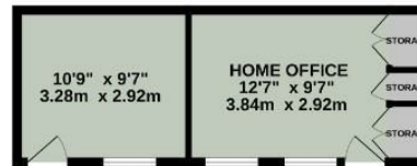
GROUND FLOOR 1164 sq.ft. (108.1 sq.m.) approx.