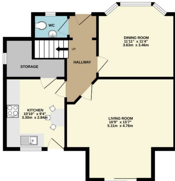
GROUND FLOOR 582 sq.ft. (54.1 sq.m.) approx.