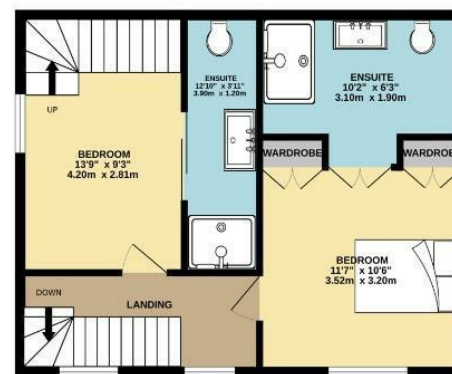
1ST FLOOR 500 sq.ft. (46.4 sq.m.) approx.