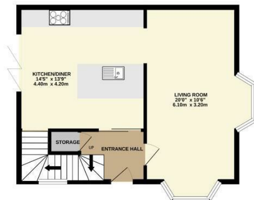
GROUND FLOOR 520 sq.ft. (48.4 sq.m.) approx.