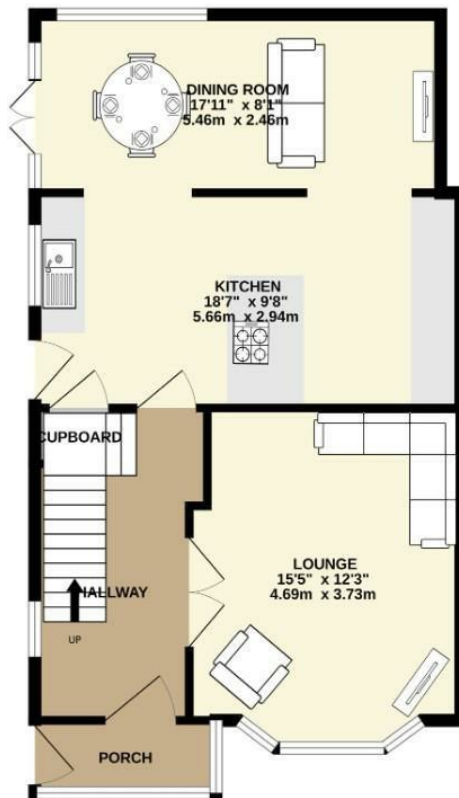
GROUND FLOOR 644 sq.ft. (59.8 sq.m.) approx.