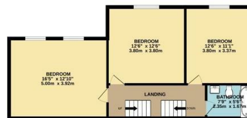
1ST FLOOR 625 sq.ft. (58.1 sq.m.) approx.