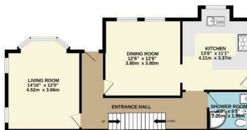
GROUND FLOOR 648 sq.ft. (60.2 sq.m.) approx.