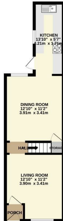
GROUND FLOOR 390 sq ft. (36.3 sq.m.) approx.