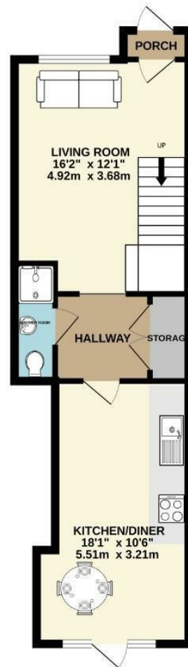
GROUND FLOOR 451 sq.ft. (41.9 sq.m.) approx.