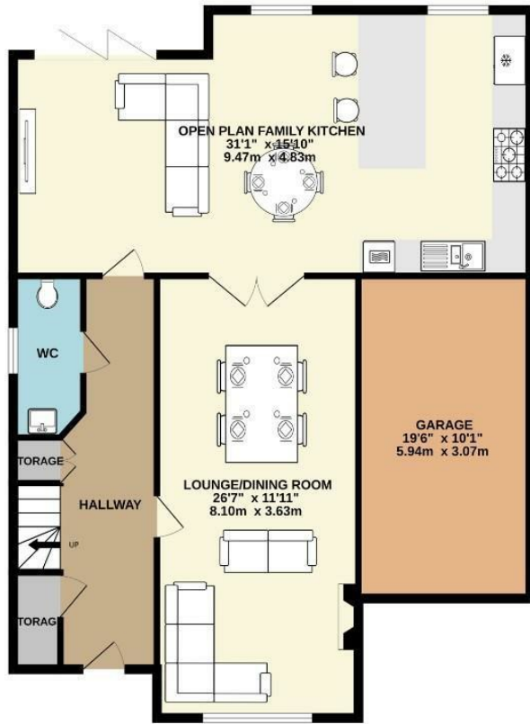
GROUND FLOOR 1204 sq.ft. (111.8 sq.m.) approx.