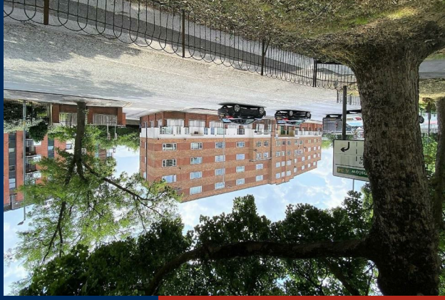
EPC Rating - C