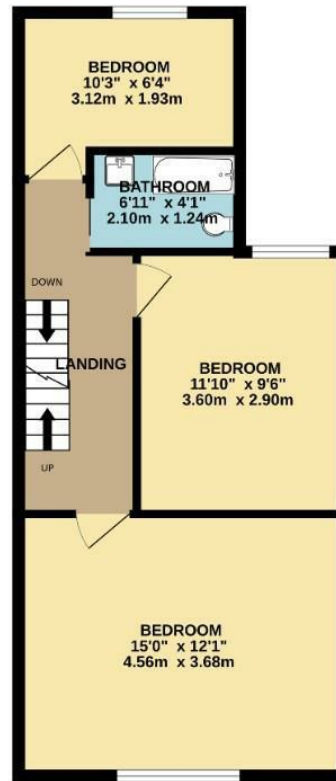
2ND FLOOR 336 sq.ft. (31.2 sq.m.) approx.