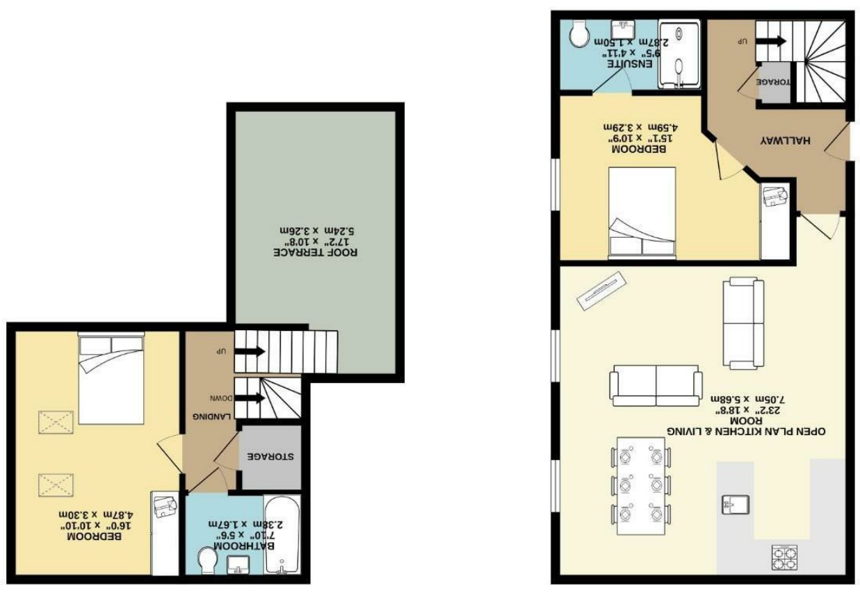
466 sq.ft. (43.3 sq.m.) approx.

TOTAL FLOOR AREA: 1132 sq.ft. (105.2 sq.m.) approx. Measurements are approximate. Not to scale. Illustrative purposes only. Made with Metropix 02024