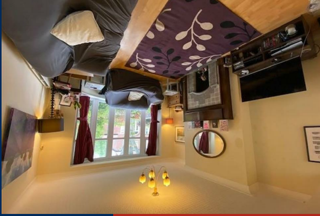
EPC Rating - D

*** AVAILABLE SEPTEMBER *** Well maintained three bedroomed semi detached FAMILY home, situated on this quiet road but within walking distance of Didsbury Village. Ideally suited to a couple or small family only, it is close by to all local amenities of Didsbury and Withington. Comprising of, to the ground floor; entrance hall with storage; lounge thru diner and a modern fitted breakfast kitchen with patio doors to large rear garden. The first floor offers two good sized double bedrooms, along with a fair single room with a modern bathroom, housing shower over bath. Benefits include a converted loft area, off road parking, gas central heating, & large rear garden. Full redecoration throughout along with new carpets to the first floor, for the new tenancy. Offered on a furnished basis. Sorry not suitable for sharers. To View Apply Didsbury 0161 4345290