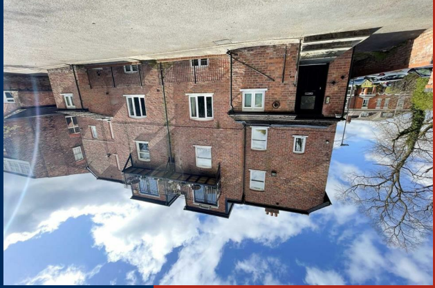
EPC Rating - B

Available with Deposit No deposit needed