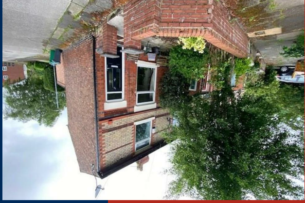
EPC Rating - E

Available with Deposit No deposit needed