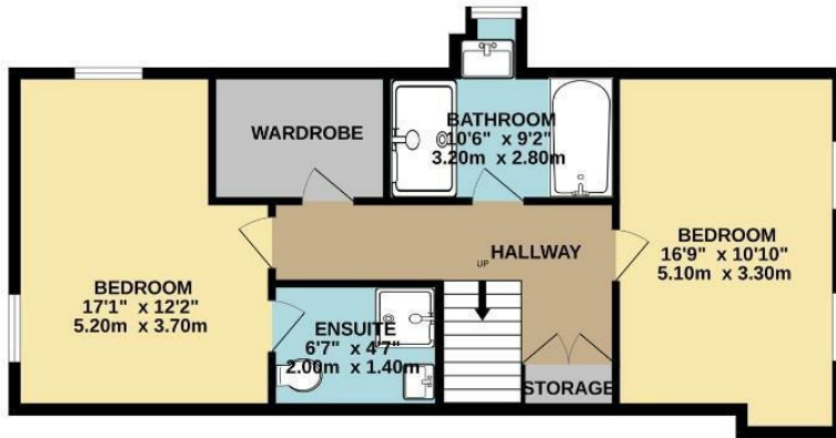
LOWER GROUND FLOOR 674 sq.ft. (62.6 sq.m.) approx.