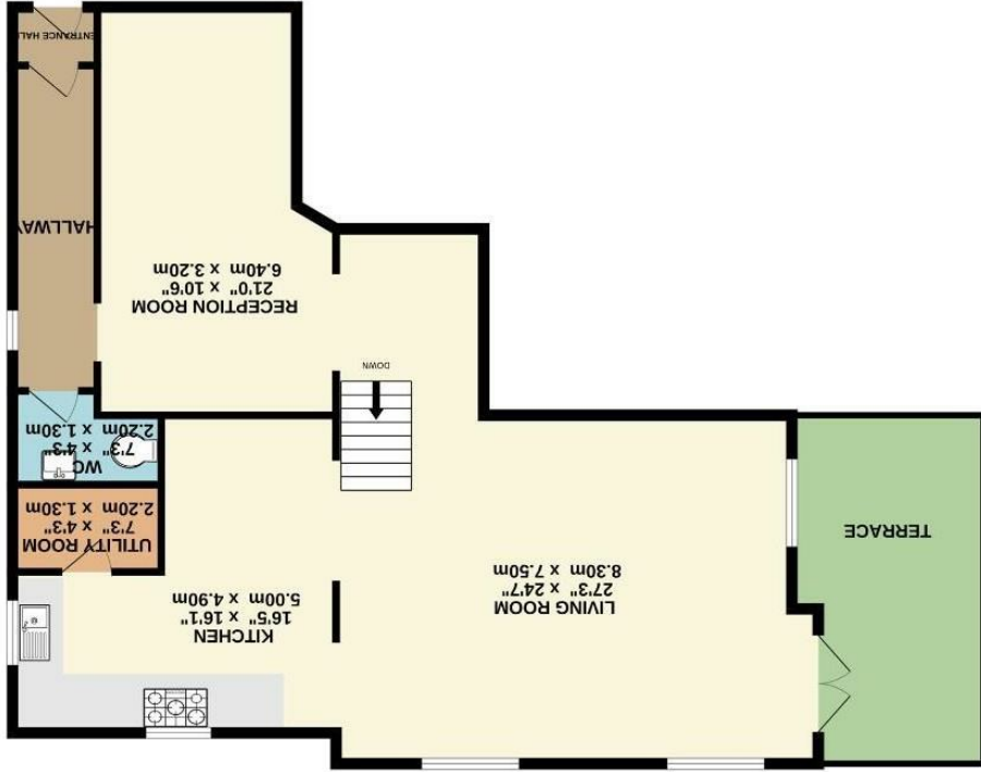
GROUND FLOOR 1082 sq.ft. (100.5 sq.m.) approx.

TOTAL FLOOR AREA : 1756 sq.ft. (163.1 sq.m.) approx. Measurements are approximate. Not to scale. Illustrative purposes only. Made with Metropix ©2024