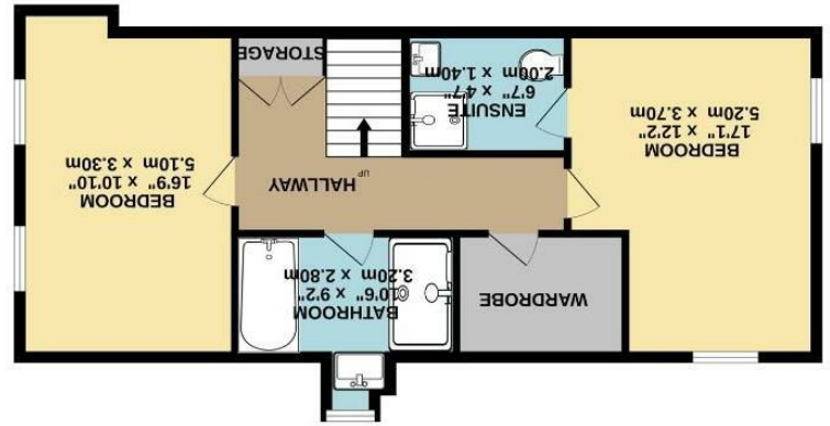
LOWER GROUND FLOOR 674 sq.ft. (62.6 sq.m.) approx.