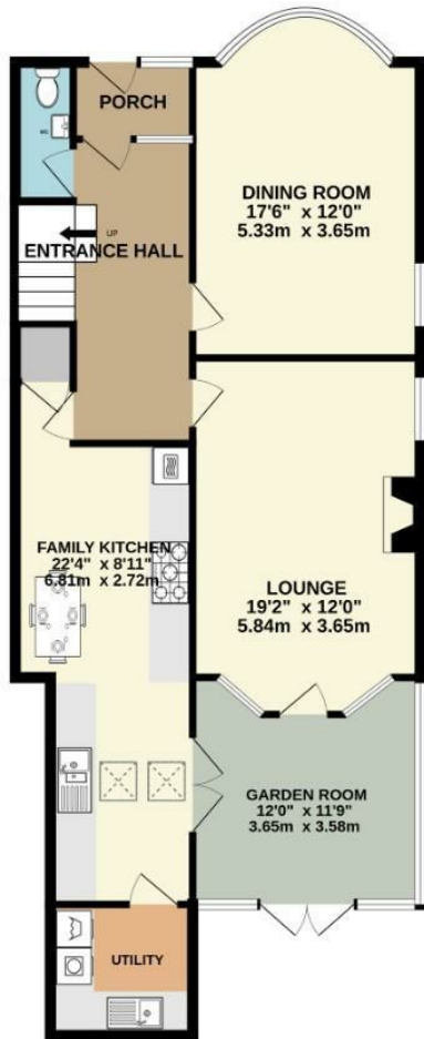
GROUND FLOOR 979 sq.ft. (91.0 sq.m.) approx.