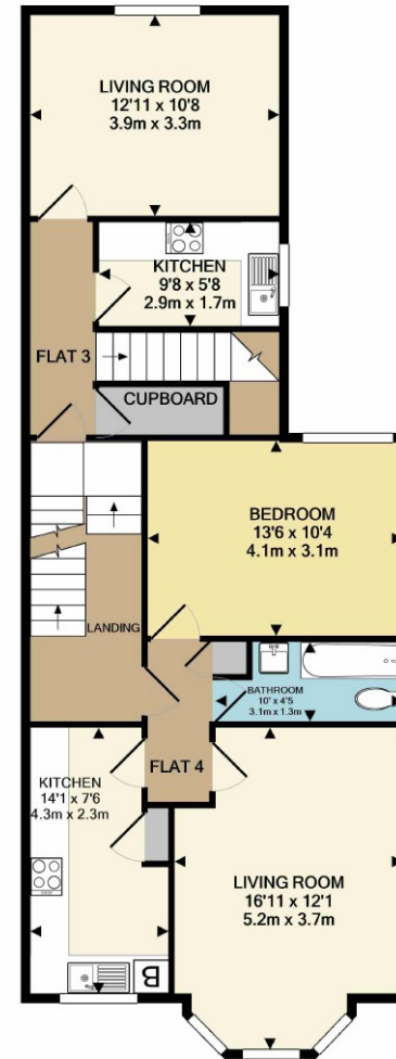
1ST FLOOR APPROX. FLOOR AREA 873 SQ.FT. (81.1 SQ.M.)