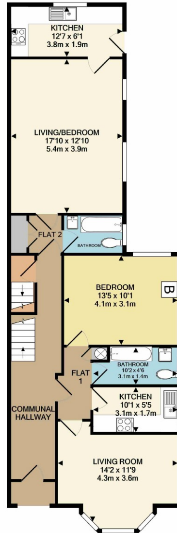
GROUND FLOOR APPROX. FLOOR AREA 961 SQ.FT. (89.3 SQ.M.)