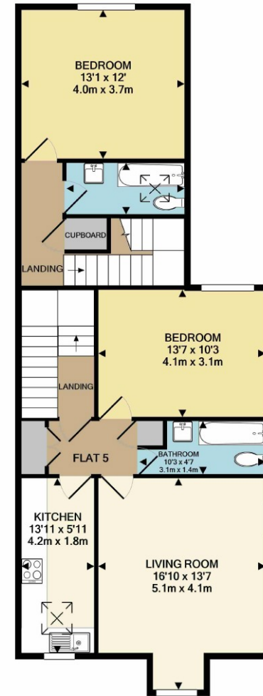
2ND FLOOR APPROX. FLOOR AREA 866 SQ.FT. (80.5 SQ.M.)

TOTAL APPROX. FLOOR AREA 3293 SQ.FT. (305.9 SQ.M.) Measurements are approximate. Not to scale. Illustrative purposes only Made with Metropix ©2021