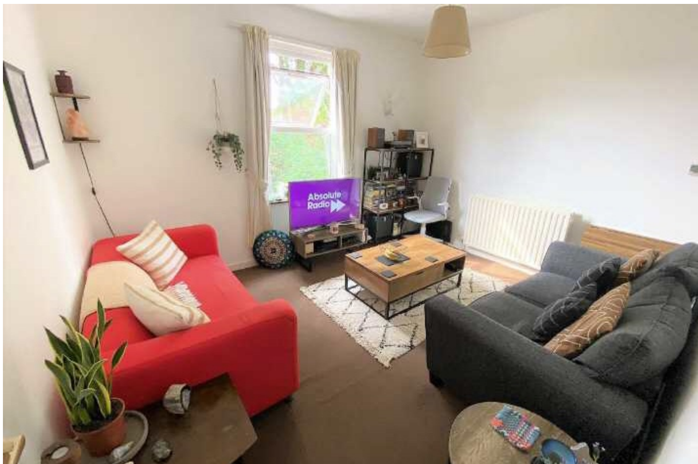
Clyde Road, West Didsbury M20 2HN Guide price £675,000