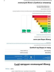
Energy Efficiency Graph

Disclaimer: Important Notice in accordance with the Property Misdescriptions Act (1991) we have prepared these Sales Particulars as a general guide to give a broad description of the property. They are not intended to constitute part of an offer or contract. We have not carried out a structural survey and the services, appliances and specific fittings have not been tested. Neither has the Agent checked legal documentation to verify the legal status of the property or the validity of any guarantee. All photographs, measurements, floorplans and distances referred to are given as a guide only and should not be relied upon for the purchase of carpets or any other fixtures or fittings. Lease details, service charges and ground rent (where applicable) are given as a guide only and should be checked and confirmed by your solicitor prior to exchange of contracts.