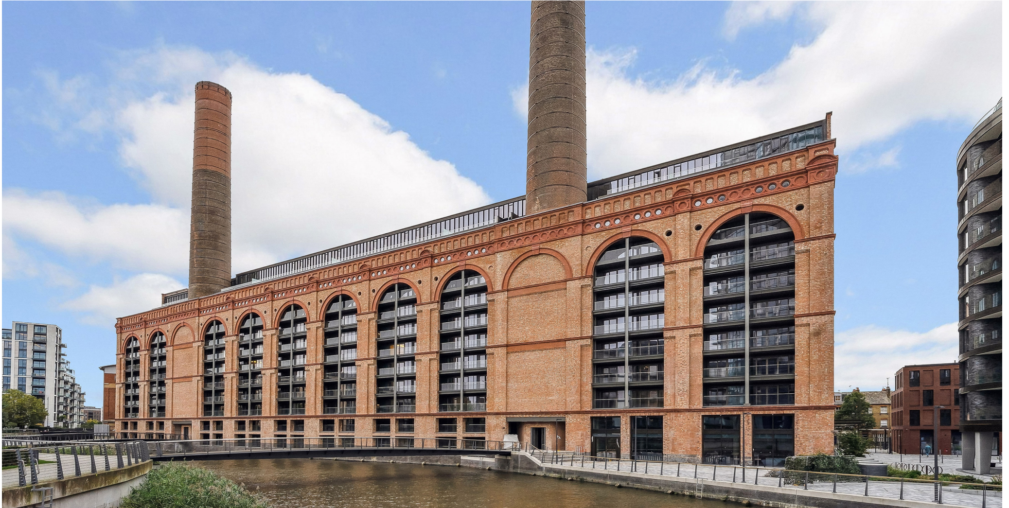
THE POWERHOUSE, Chelsea SW10