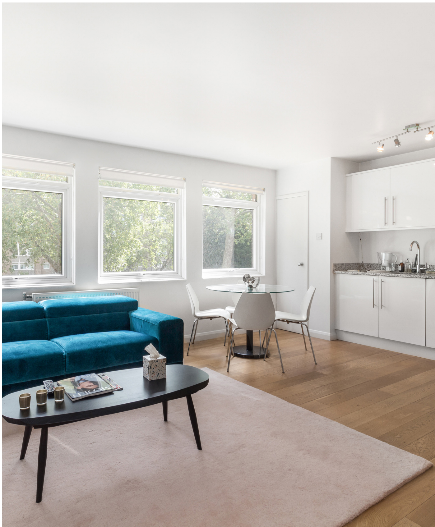
ELM PARK GARDENS, Chelsea SW10