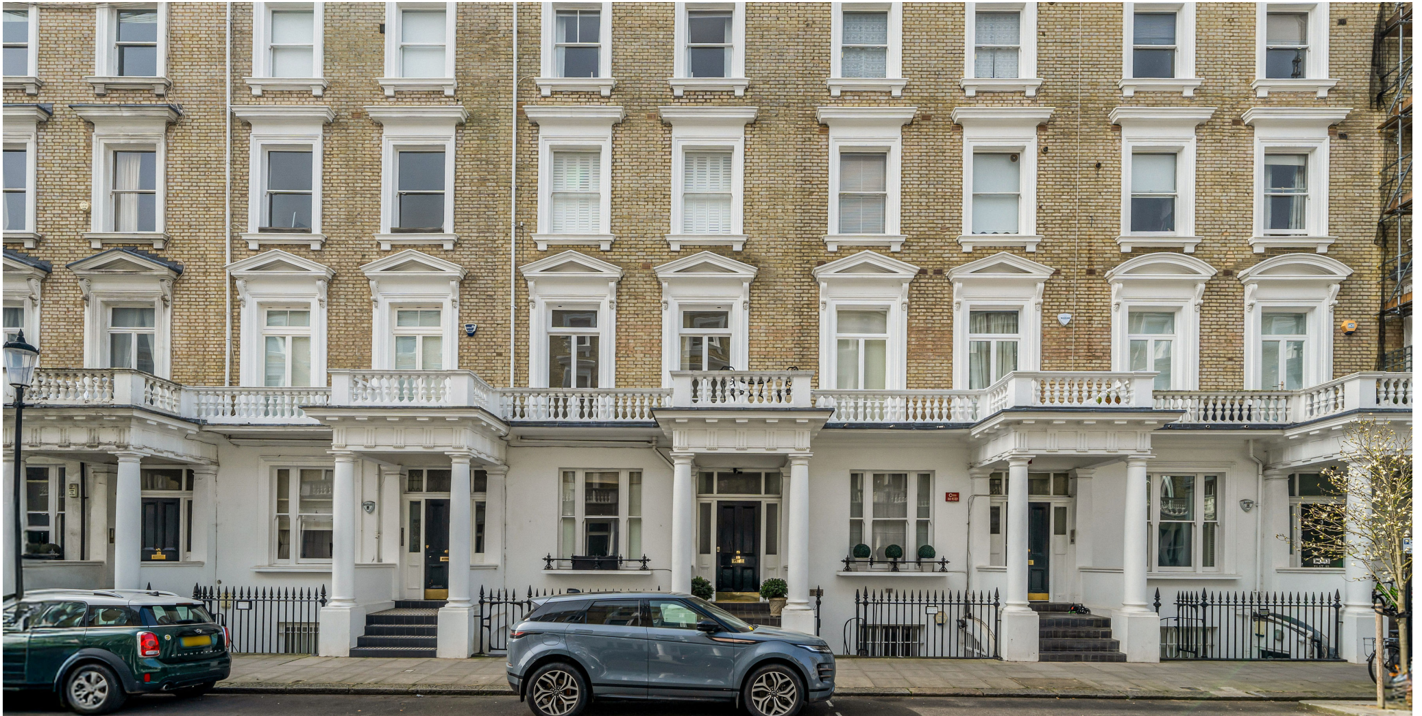
HARCOURT TERRACE, Chelsea SW10