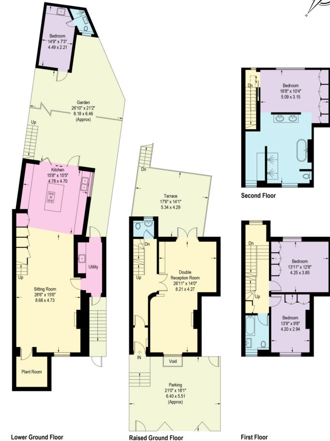
Illustration for identification purposes only, measurements are approximate, not to scale. (ID1091597)

This plan is for guidance only and must not be relied upon as a statement of fact. Attention is drawn to the important notice on the last page of the text of the Particulars.