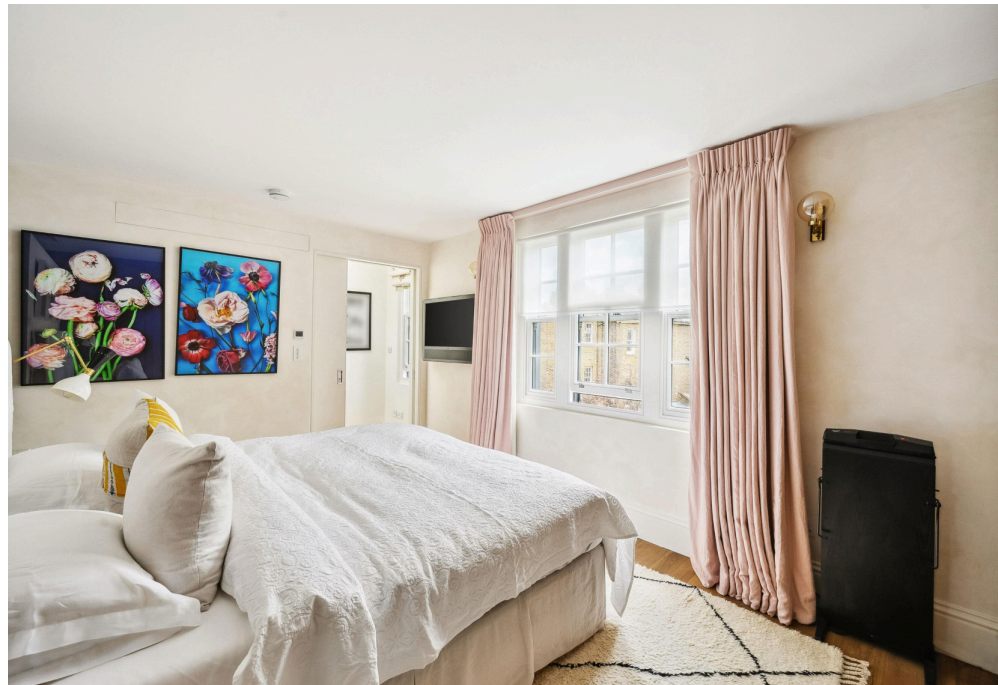
A Uniquely modern four bedroom house in Fulham Road